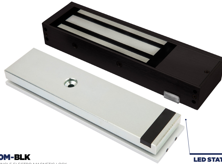
EM5700M-BLK MONITORED SINGLE ELECTRO MAGNETIC LOCK