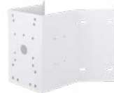
AT-200 Corner Mount Adapter