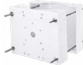
AT-101 Pole Mount Adapter