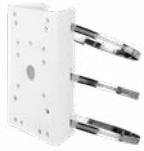
AT-100 Pole Mount Adapter