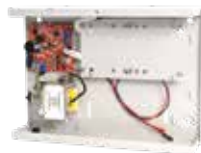
995200PE3 small enclosure shown