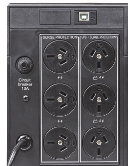
PSD1200 | PSD1600 | PSD2000