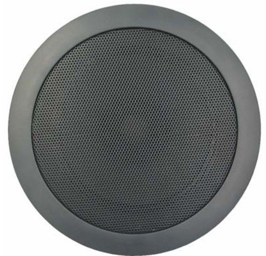
SP-100-BK Black 100mm Speaker