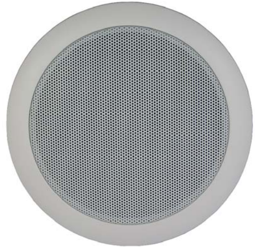
SP-100 White 100mm Speaker