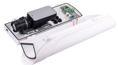
AXIS Q1635 + 8 – 80mm varifocal lens