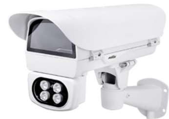
AETEK A1020 housing + BK-101 wall mount bracket + Sunshield