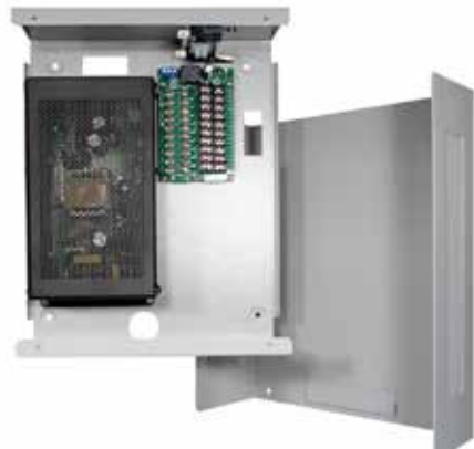
TP Small-Kit, Power Module & PDM

PO Box 90 Kurrajong NSW 2758 Australia Tel +61 1300822769 sales@tacpower.com.au