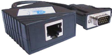
PC Balun Part No: E10680C