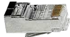
Shielded RJ45 Plug