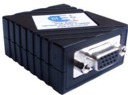
Monitor Balun Part No: E10680M

The VGA Balun has been specifically designed to allow a VGA Monitor to be remotely located from the computer. The VGA Balun comprises a PC Balun and a Monitor Balun. They must be used together as a pair. Shielded Category 5e cable terminated in shielded RJ45 Plug must be used to interconnect the 2 units otherwise there will be picture distortion.