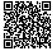
Scan here for more layout examples: