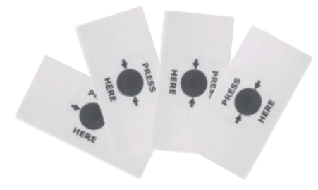
CP-31-PL Plastic Glass Element 4 pcs in a pack