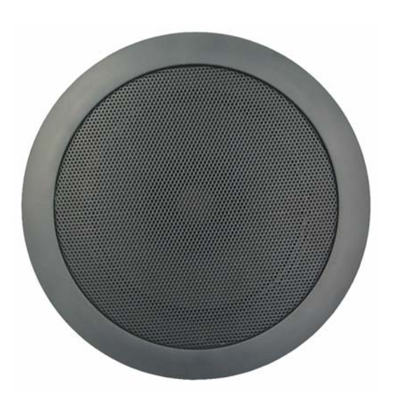
SP-100-BK Black 100mm Speaker