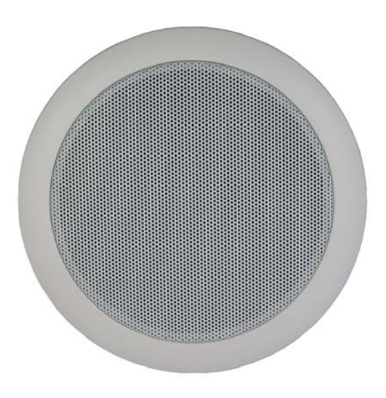
SP-100 White 100mm Speaker