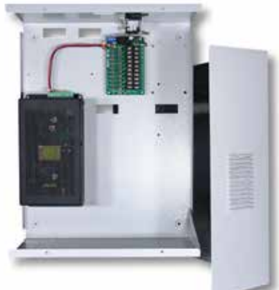
TP Medium-Kit, Power Module & PDM

PO Box 90 Kurrajong NSW 2758 Australia Tel +61 1300822769 sales@tacpower.com.au