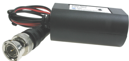
Power Through Video Balun BNC Male to RJ45 Jack with 300mm lead Part Number: E10524